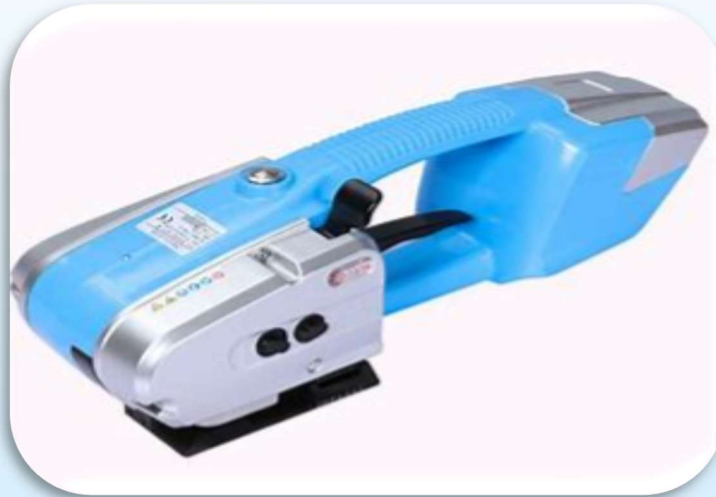
Electric Hand Strapping M/C